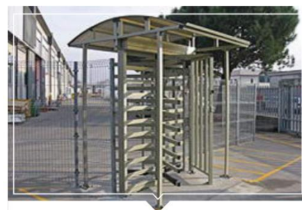
The ARNEG's plant of refrigeration systems. Padua, Italy