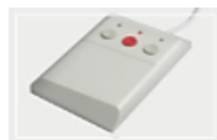
Control panel for remote management