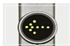
LED indicator of way direction

By means of an extra foundation frame RF01, the turnstile can even be installed on an unstable ground.