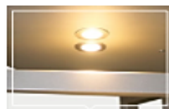
Walkway lighting in the ceiling