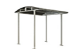
Special protecting apron for full height turnstile