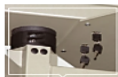
Turnstile mechanical unlocking